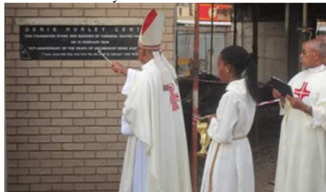
Cardinal Wilfrid Napier OFM blessing the foundation stone of the Denis Hurley Centre on 13 February 2014, 10 th Anniversary of Archbishop Hurley's death